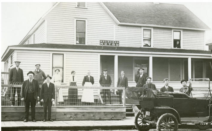
Delburne Hotel in 1915

www.alberta.ca/vehicle-registration.aspx