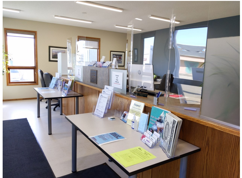
The Village office is ready with COVID-19 prevention measures in-place

The Village of Delburne municipal office opens to the public on Tuesday, April 6th. The Village office was closed back in November 2020 when the Government of Alberta enacted stronger public health measures to protect the health system and slow the spread of COVID-19. As part of the enhanced measures, the Province made it mandatory to work from home unless the employer required the employee's physical presence to operate effectively. Since staff were unable to perform duties from home, Council's solution was to close the doors to the public but still have administration work inside the municipal office.