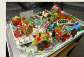
Grades 1 - 6: Holden Kelly