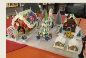
Adult: Quynn Almond