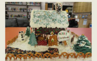
Grades 7 - 12: Robin Farnel