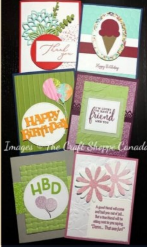
Images - The Craft Shoppe Canada